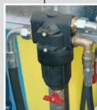
Self cleaning high pressure filter